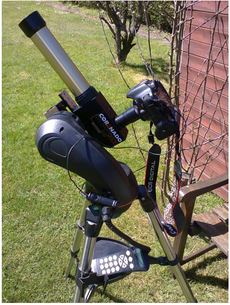
Figure 14 – Imaging Setup