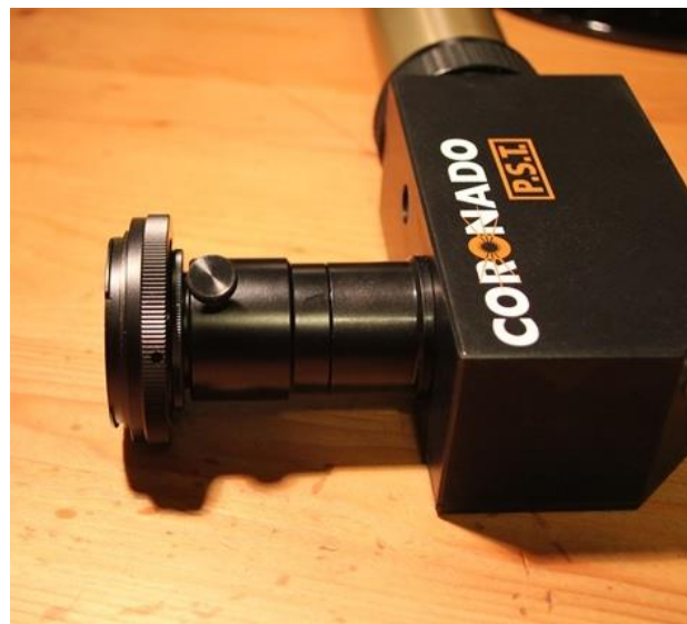
Figure 13 – Fitted to the PST

If you find that the lens is hitting the bottom of the PST eyepiece holder causing the T adaptor to be sitting up proud of the PST eyepiece holder you can cut or file a smidgen off the T adaptor, but be very careful not to make the T adaptor too short as you do need the Barlow lens as close to the bottom of the PST eyepiece holder as possible; a millimetre can make a big difference.