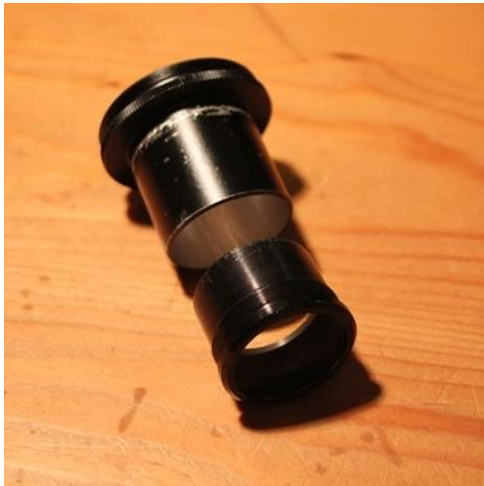
Figure 9 – Slide the Barlow lens into the T adaptor