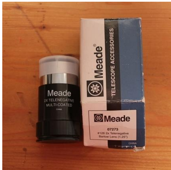
Figure 4 – Meade #126 2x Barlow (1 1/4")

Note: The method described in this document is only possible due to the construction of the Meade #126 2x Barlow which allows it to be deconstructed, it may not work with other types of Barlow due to different constructions.