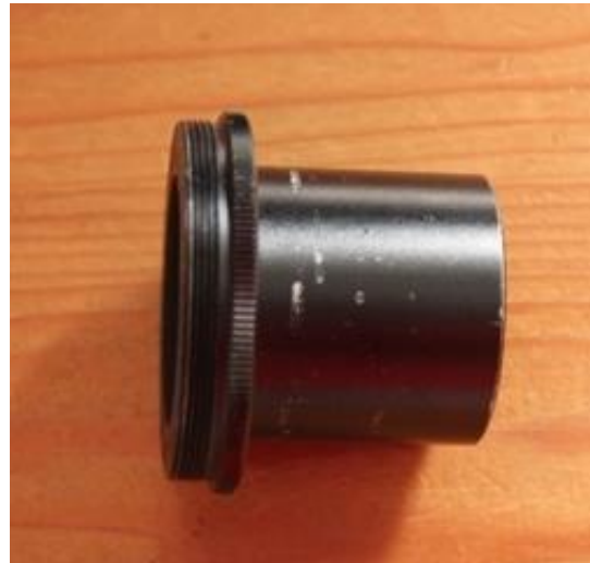
Figure 3 – T Adaptor (1 1/4")