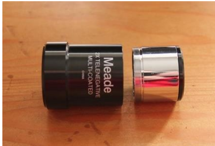
Figure 5 – Unscrew the lens assembly

The first step is to disassemble the Barlow lens; the Meade #126 2x Barlow is made up of three parts which all unscrew from each other as shown below in Figure 5 and Figure 6: