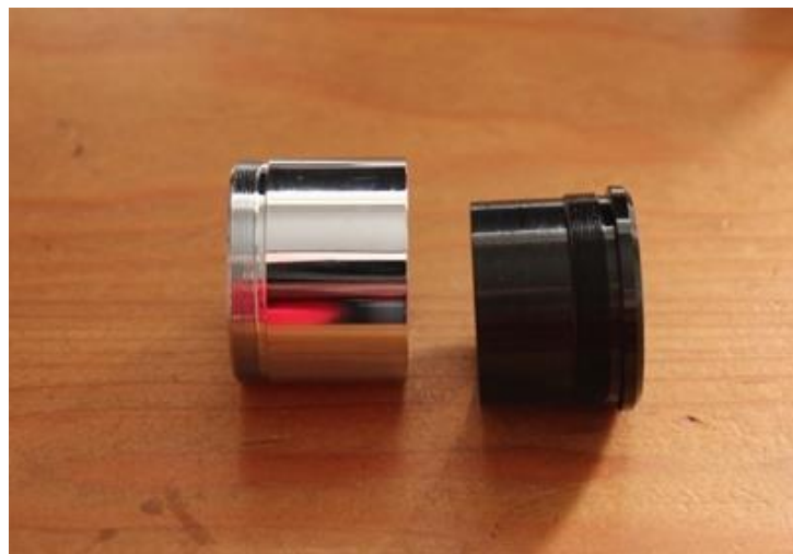
Figure 6 – Unscrew the lens