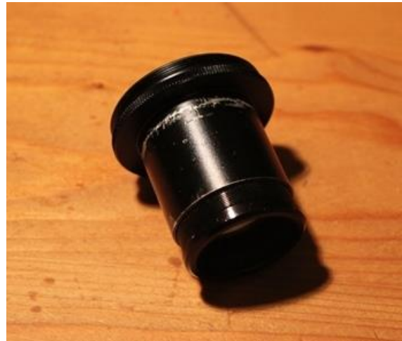
Figure 10 – T adaptor and lens assembled