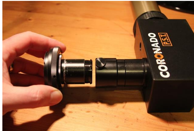
Figure 12 – The finished T adaptor on T ring

Figure 12 and Figure 13 below show how the adaptor slides all the way into the PST eyepiece holder. It is critical that the bottom of the Barlow lens is as close to the bottom of the PST eyepiece holder as possible as otherwise you will not get the back focus required. The critical dimensions are explained on the previous page.