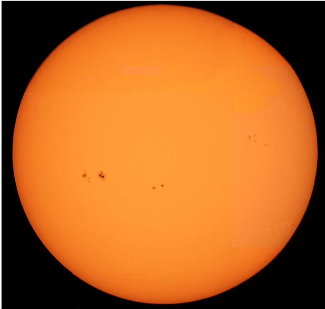
Figure 16 - The Sun in white light– 3 rd May 2013