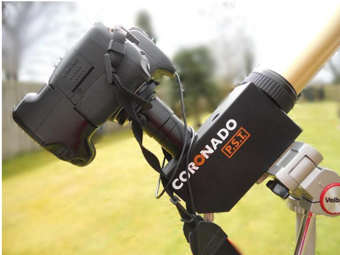
Figure 1 – PST with a Canon DSLR

The final result is shown below (Figure 1). The rest of this document explains how to get there.