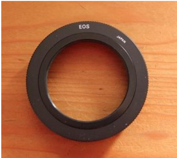
Figure 2 – Camera T Ring

You will need the following three items for making the camera adaptor; these are shown below in Figure 2 to Figure 4: