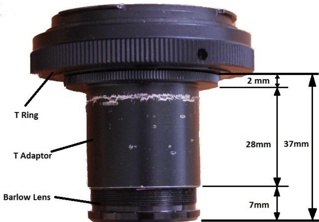
Figure 11 – Finished Adaptor Dimensions

On my PST the eyepiece holder is 35mm deep therefore it is important to get the overall length of the T adaptor from its shoulder plus the Barlow lens as close to (but not more than) 35mm as possible. The image below of my finished adaptor shows an exact measurement of 35mm (37mm with the shoulder) which allows for an exact fit to the PST eyepiece holder and allows plenty of focus adjustment either side of focus with my Canon DSLR.