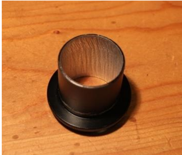
Figure 8 – The finished T adaptor